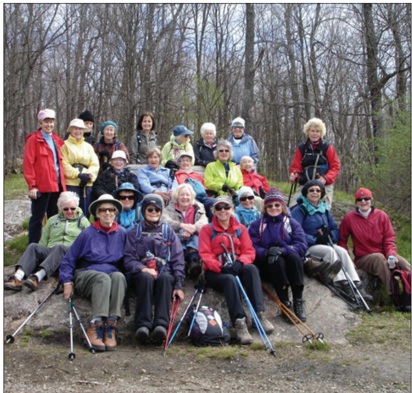
Gatineau Trails Hiking Group enjoying the outdoors on Tuesday, April 17, 2012.