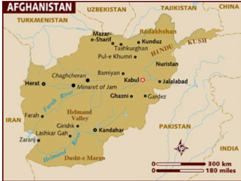
Figure 1: Map of Afghanistan

However, education has improved dramatically since the Taliban’s misogynist regime, when girls were prohibited from attending school. Due to the work of the Ministry of Education and a plethora of international aid agencies, there are now 7.5 million children in school, 2.9 million of whom are girls. This is an improvement from 900,000 children in 2000, of which girls were only 5,000. About 6 million children are not attending school. These statistics are supplemented by data