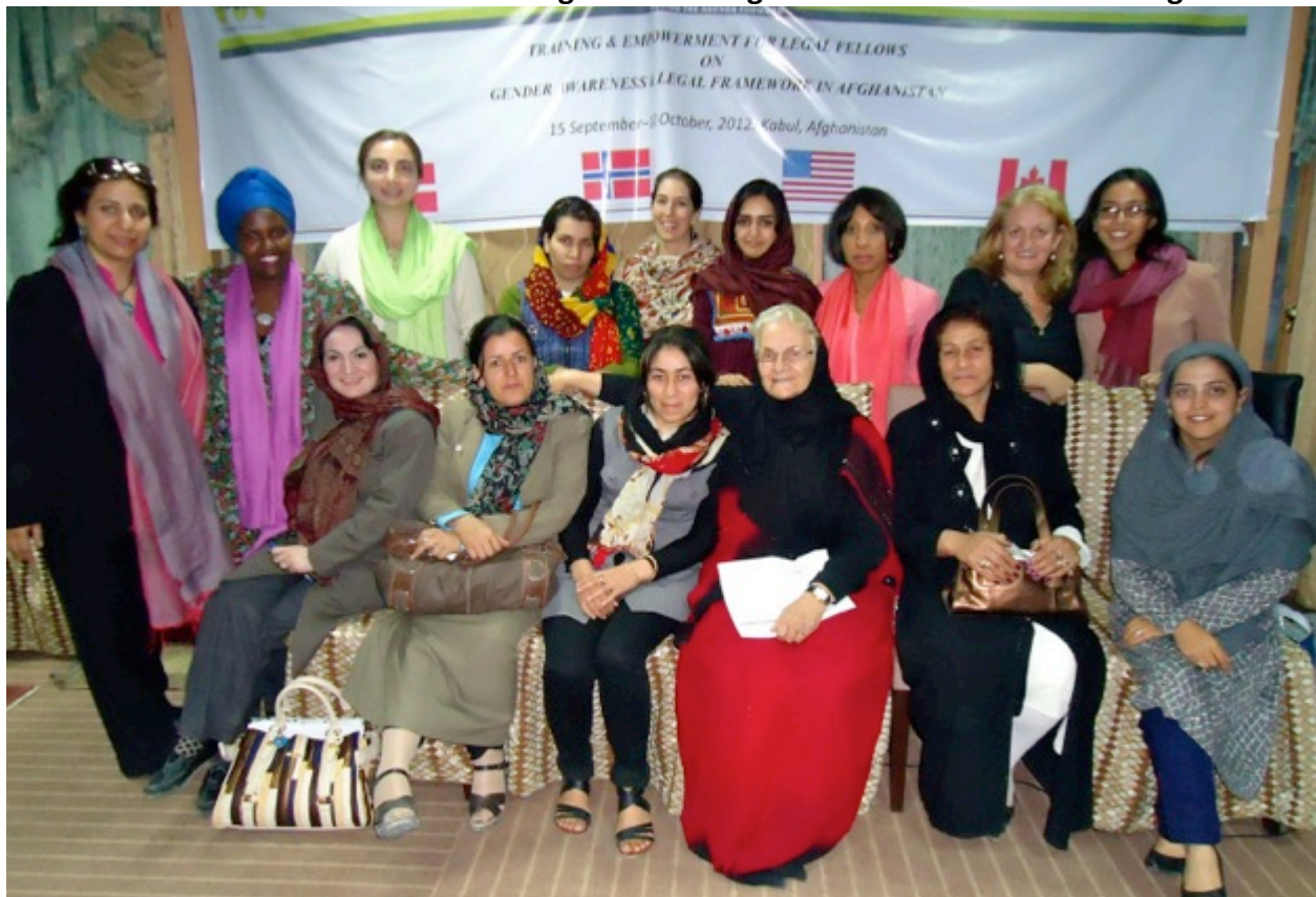
Picture 4: Women who attended first Afghan women graduates information meeting