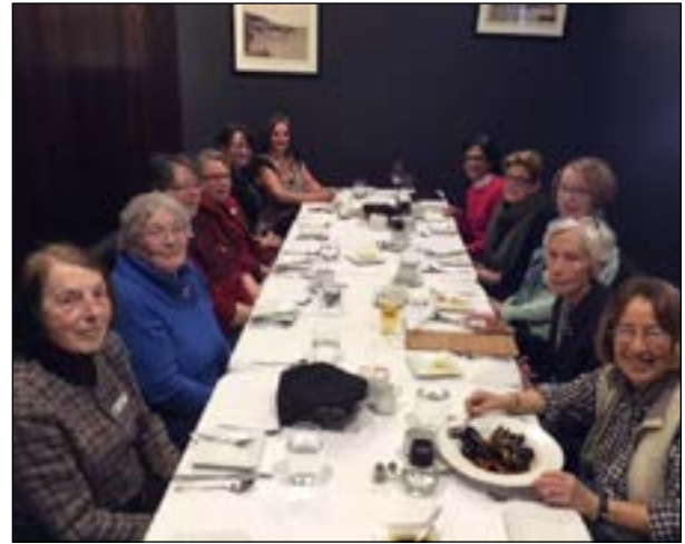
Great company, good food, and pleasant conversations are regularly enjoyed by CFUW-Ottawa's interest groups. In January, for example, The Tuesday Lunch group appreciated the Cucina de Vito Italian Restaurant in Orleans.