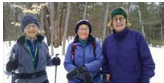
The new group, Snowshoe in the Wild , is enjoying a series of outings, three of its members shown here.