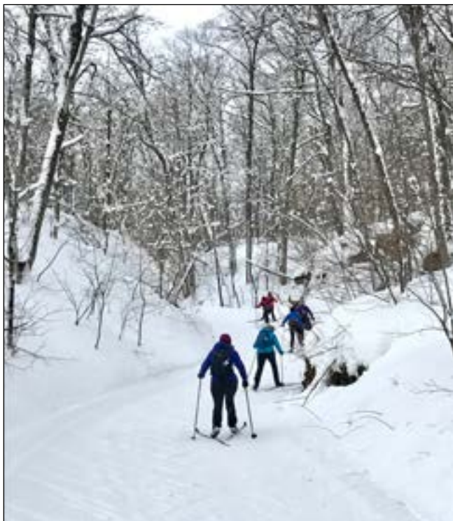
February 4, two groups of Gatineau Trails skiers skied uphill to meet at Huron Cabin for lunch.