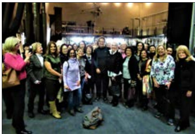
On Friday, January 31st, the DHG were given a private tour of the National Arts Centre, discovering the the costume and prop rooms, the make-up areas, the lighting and staging areas, and visiting the four stages at the NAC. Backstage, they even met Jim Cuddy of Blue Rodeo , preparing for a rehearsal.