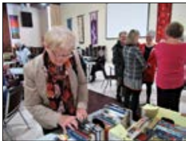
At the General Meeting in February.

We appreciate exact change, so please bring your toonies and loonies to our next General Meeting. Do not bring more used books as we have more than enough to sell. See you at the table!