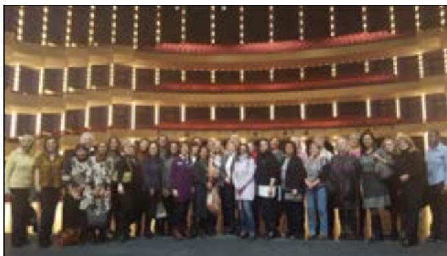
DHG members and guests at the NAC.