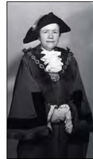
Charlotte Whitton

“Whatever women do they must do twice as well as men to be thought of half as good. Luckily, this is not difficult.” ( Canada Month , June 1963)