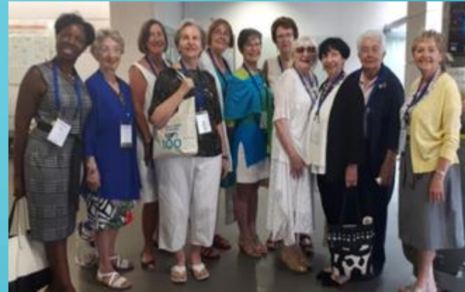
CFUW Delegation to Geneva