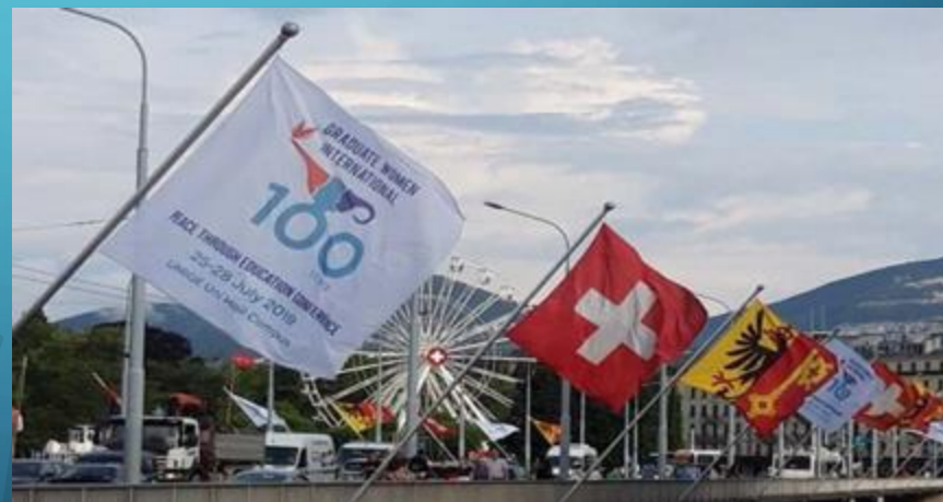
GWI Centenary flags flying with the Swiss country & Canton of Geneva flags over the famous Mont Blanc Bridge