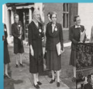
1946 Council London