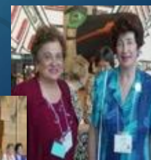
2001 -27 th Triennial Ottawa