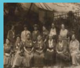
1922 -IFUW Council