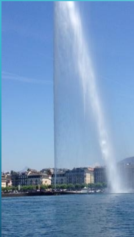
Jet d'Eau, Lake Geneva