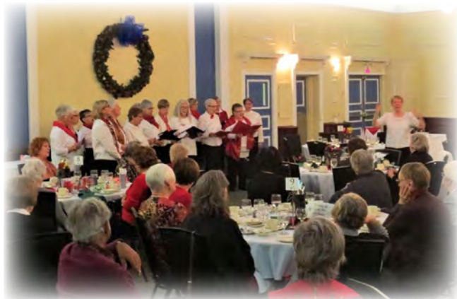
After lunch, the Madrigals led everyone in a fun sing-song of holiday favourites.

The December 3 rd . Holiday Luncheon was an enjoyable and fun event for all who attended. Close to 110 people appreciated a delicious lunch put on by the RA Centre.